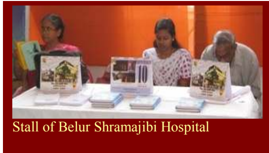
Stall of Belur Shramajibi Hospital