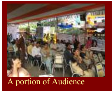
A portion of Audience