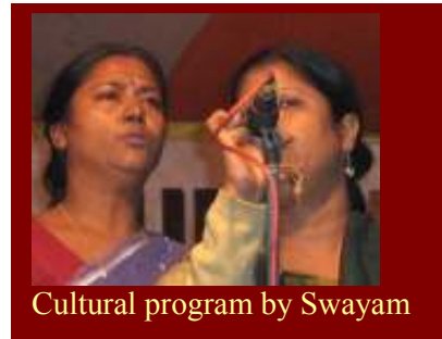
Cultural program by Swayam