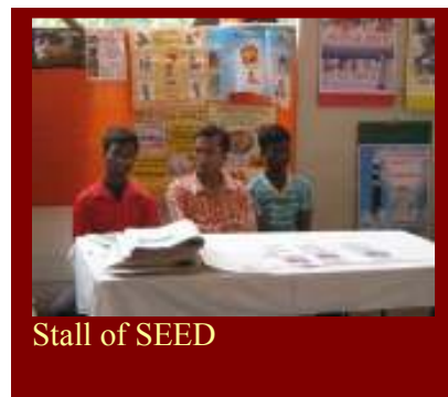
Stall of SEED