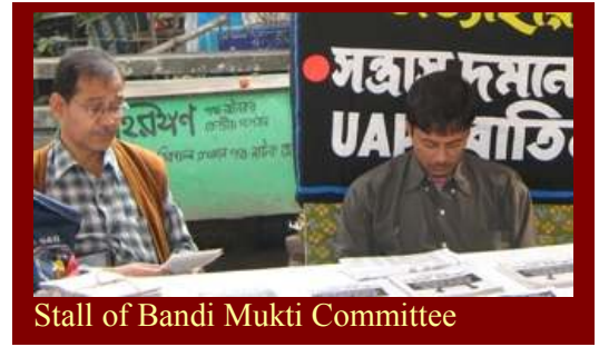
Stall of Bandi Mukti Committee